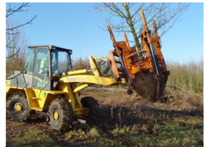
Transplanting of sapling trees

High Speed Two (HS2) is the new high speed railway for Britain. In response to the Covid-19 virus we have worked hard to ensure that our working practices are fully aligned with the Site Operating Procedures produced by the Construction Leadership Council. We will be keeping our local website www.hs2inbucksandbox.co.uk up to date with information on our works, and the measures we have in place to maintain the safety of the community and our workforce.