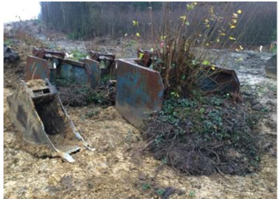
Transplanting coppice stools

Bottom right image Woodland soil excavated and being transferred via tracked dumper to the receptor site