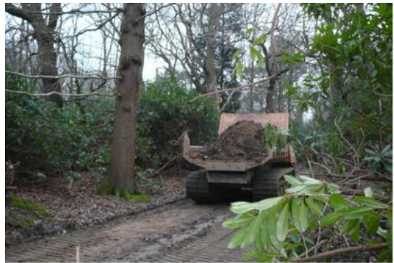
Transfer of woodland soils to the new receptor site